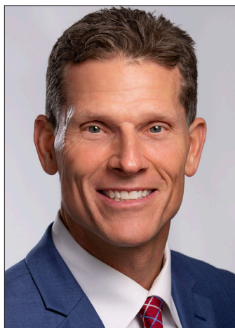
Brent Venables Head Coach