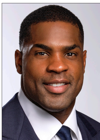
DeMarco Murray Running Backs