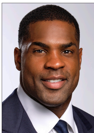
DeMarco Murray Running Backs