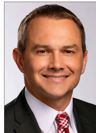
Brandon Hall Safeties