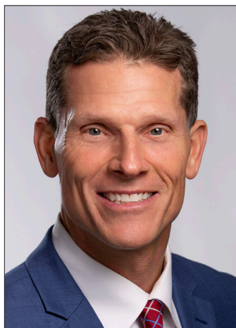
Brent Venables Head Coach