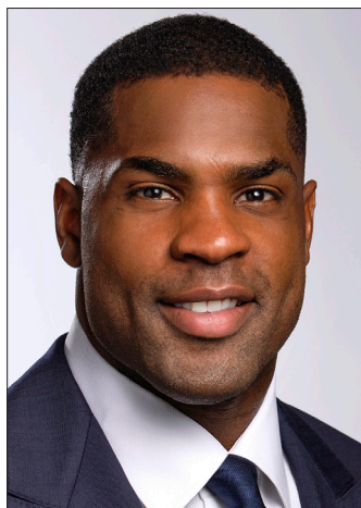
DeMarco Murray Running Backs