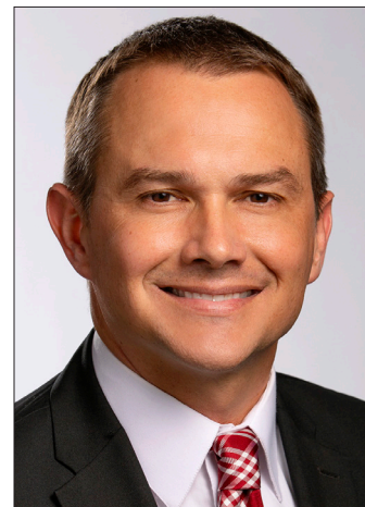
Brandon Hall Safeties