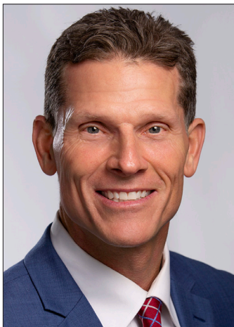
Brent Venables Head Coach