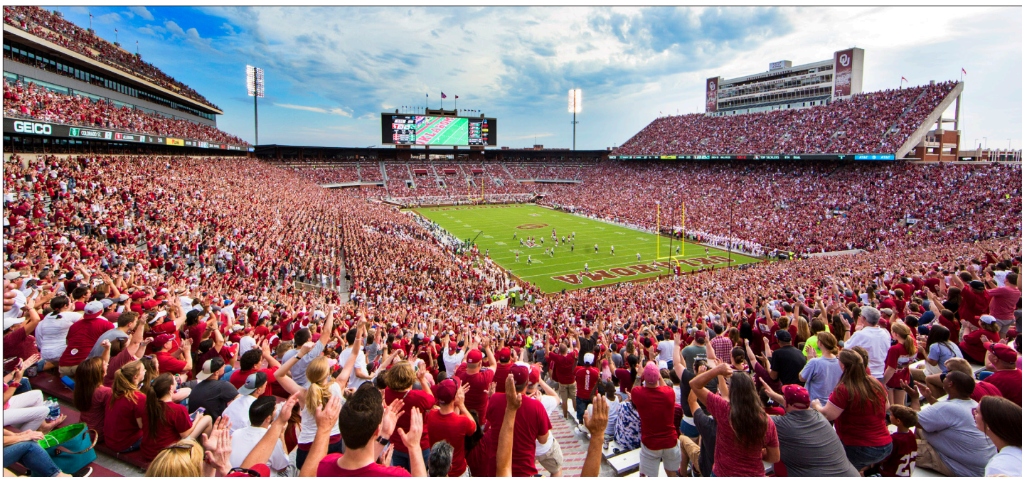
OU's $160 million stadium renovation and modernization project bowed in the south end of the facility and added premium seating and a 62-feet-by-38-feet video board.